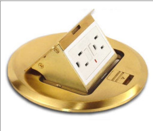
PUB20G Pop up table box

The PUX20G pop up table boxes are loaded with 20A GFCI's.