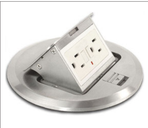
PUS20G Pop up table box